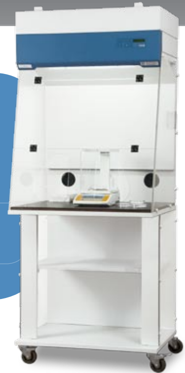
Esco Powdermax 1 Powder Weighing Balance Enclosure Model PW1-3A_